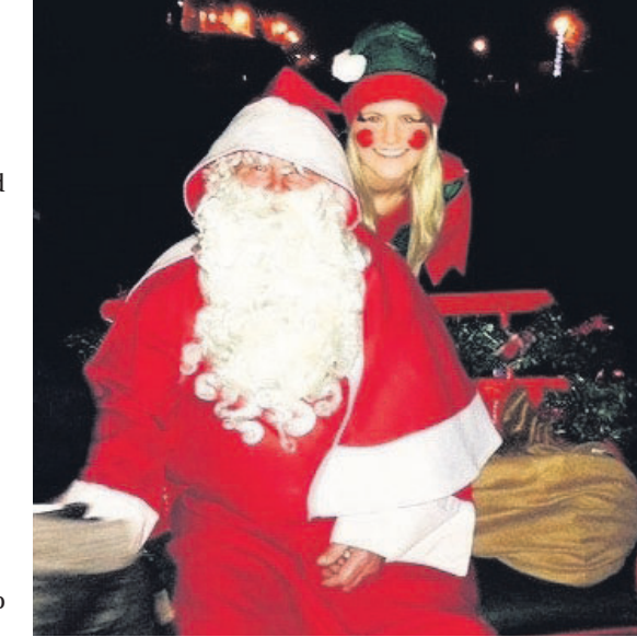
Santa and an elf at Bredbury Hall

Marple Brass Band also entertained with their rousing renditions of Christmas songs and carols to get everyone into the spirit of the festive season.